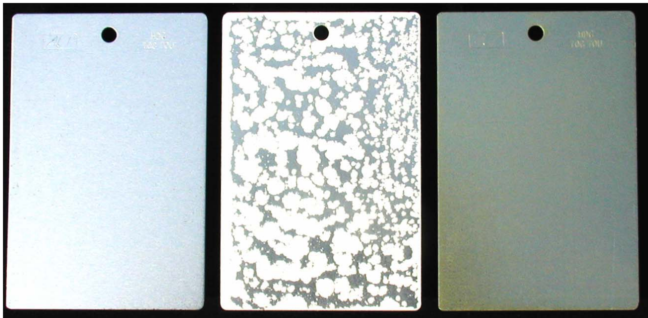
New Galvanized Steel